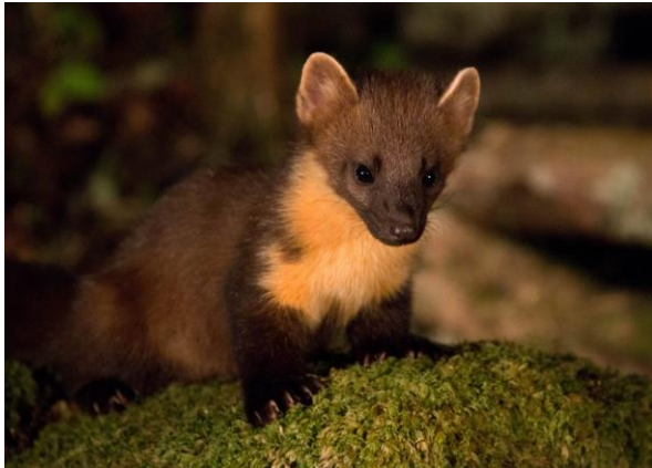
Pine marten

according to plan, they will begin to re-introduce martens into the FOD in the autumn of 2018, some of these animals will almost certainly cross the border into Herefordshire soon after their release. With all these neighboring Martens at our borders, it is only a matter of time before we have our own wild population of Pine martens in Herefordshire.