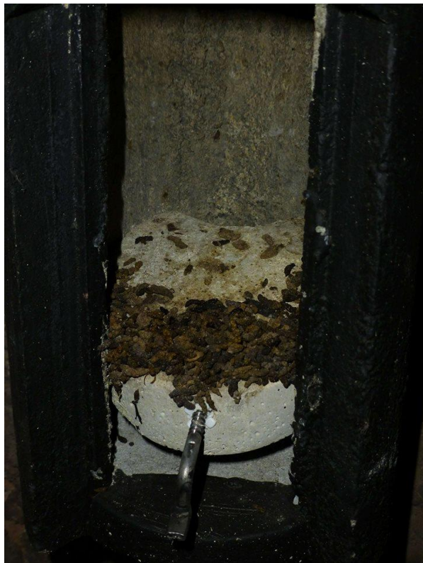
Photo: Both bat boxes inside the bell chamber contained long-eared bat droppings.

HMG has carried out preliminary surveys at 18 new churches, 5 Volunteer Bat Roost Visits and monitoring checks at Pembridge and Wellington Church during the summer. There has also been a joint effort for carrying out swift surveys with Herefordshire Ornithological Club which has resulted in 46 swift surveys.