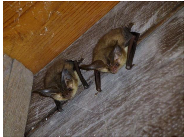
Photo: Two resident brown long-eared bats inside the tower at Staunton-on-Wye church.

A roost visit took place at Tenbury Wells church in 2015 where HMG recommended the installation of bat and swift boxes as part of the church's HLF repair grant. The church is now ready to purchase and install boxes and well as making our recommended modifications to the tower to allow bats access. Scaffolding is currently in place so this is the only time this work can be carried out.