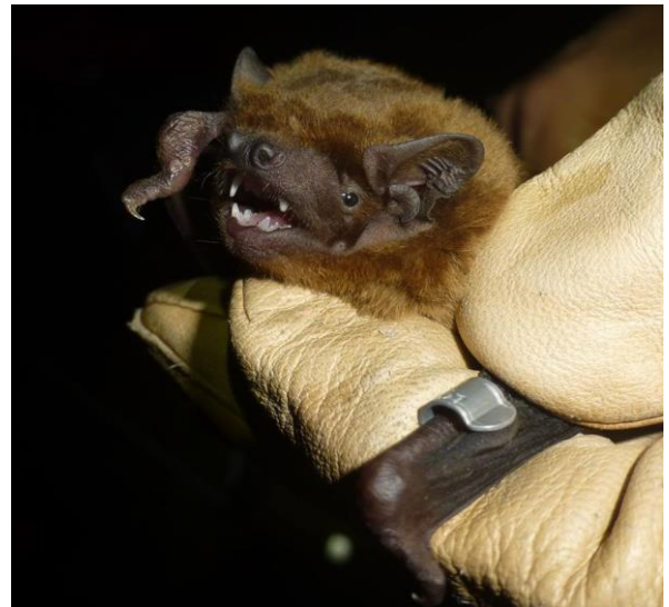
Photo: Post lactating female Noctule was radio-tagged during the project

The radio-tracking at National Trust property Berrington Hall near Leominster which took place at the beginning of August was a great success. Two females were caught and subsequently fitted with radio-tags funded by the National Trust, a non-breeding Bechstein's bat and a post-lactating Noctule. It was a gamble to radio-tag a Noctule due to the distances they can commute, but our female stayed local and she lead us to 5 new tree roosts in and around the grounds of Berrington Hall; she also introduced us to 27 of her friends.