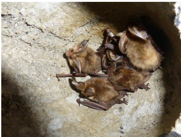
Photo: A breeding female was tagged from a bat box at Lea and Paget's Wood.

The only bat radio-tagged at May's Bat Tracking event was a ringed BLE from a bat box in Lea and Paget's wood. A box of 4 bats were found roosting together; 2 parous females ringed in 2014 (who routinely roost together), a male and a non-breeding female ringed as adults in 2015. All 4 four bats were found roosting together again in 2016. Despite the tag being prematurely groomed off in a roof void of a house SE of the wood (same house as in 2016), after 24 hours, we managed to save the project and counted out bats from the car port for 3 consecutive nights. A maximum of 12 bats emerged from the car port. During the counts bats were observed flying towards the roost entrance and after a second bat emerged a pair would fly away together – this could possibly be females with their older offspring.