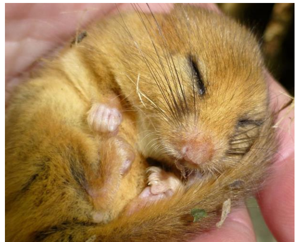
Torpid dormouse