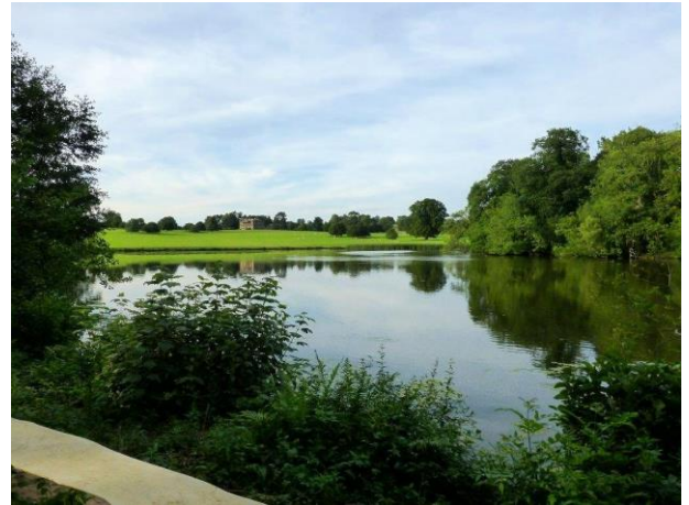
Photo: Berrington Hall near Leominster

The radio-tracking at National Trust property Berrington Hall near Leominster which took place at the beginning of August was a great success. Two females were caught and subsequently fitted with radio-tags funded by the National Trust, a non-breeding Bechstein's bat and a post-lactating Noctule. It was a gamble to radio-tag a Noctule due to the distances they can commute, but our female stayed local and she lead us to 5 new tree roosts in and around the grounds of Berrington Hall; she also introduced us to 27 of her friends.